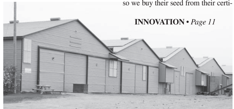
Potato storage units at Sunrise Potato.